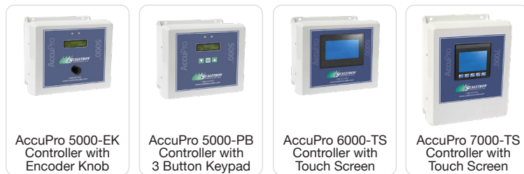
AccuPro 5000-EK Controller with Encoder Knob