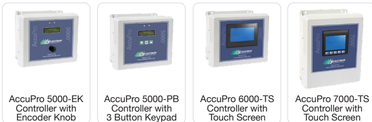
AccuPro 5000-EK Controller with Encoder Knob