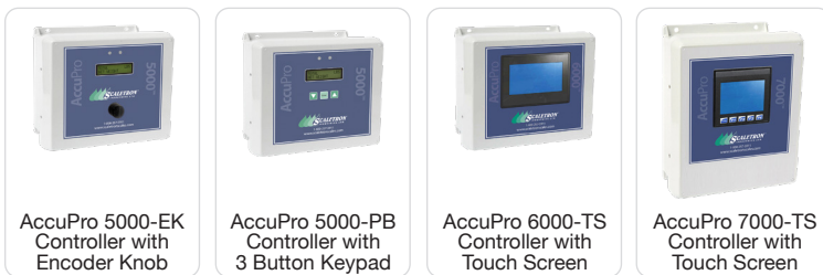
AccuPro 5000-EK Controller with Encoder Knob