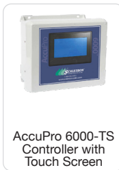
AccuPro 6000-TS Controller with Touch Screen