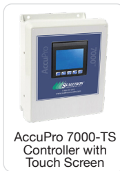
AccuPro 7000-TS Controller with Touch Screen