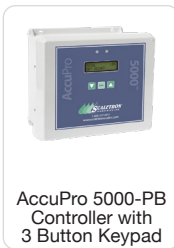
AccuPro 5000-PB Controller with 3 Button Keypad