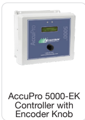
AccuPro 5000-EK Controller with Encoder Knob