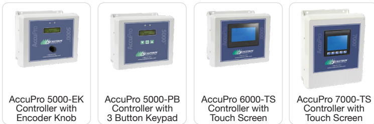
AccuPro 5000-EK Controller with Encoder Knob