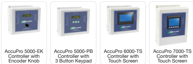
AccuPro 5000-EK Controller with Encoder Knob