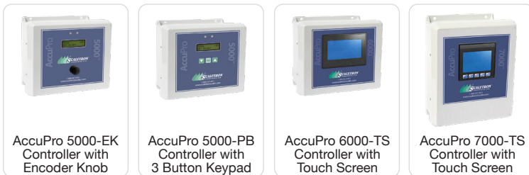
AccuPro 5000-EK Controller with Encoder Knob