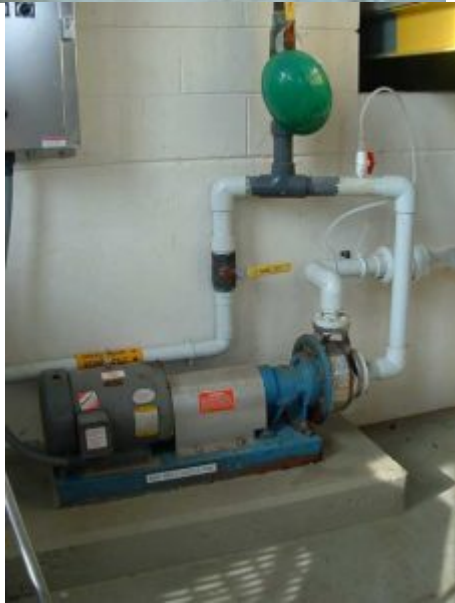
Install high-pressure tubing between pump and injection fitting.